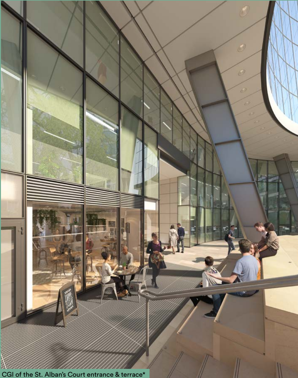
CGI of the St. Alban's Court entrance & terrace*