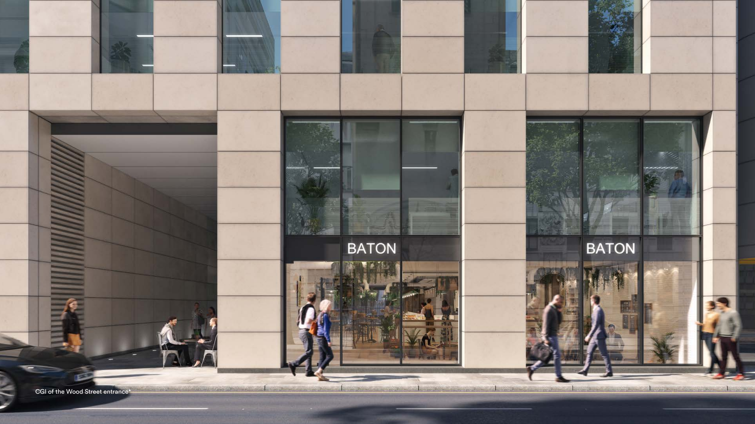
CGI of the Wood Street entrance*