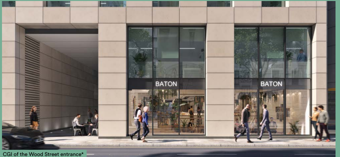
CGI of the Wood Street entrance*