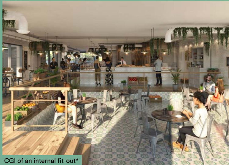
CGI of an internal fit-out*